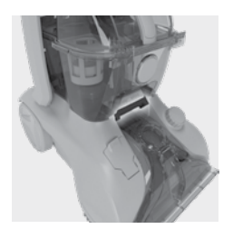
Lift the tank release clip and unhook from the front of the dirty water tank.

IMPORTANT: Always empty and rinse out clean and dirty water tanks and leave to air dry before replacing. Do not leave solution stored in the tanks between uses.