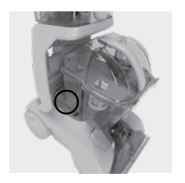
To re-fit, slide the dirty water tank onto the carpet washer, making sure the tabs on the tank line up with the back of the washer.