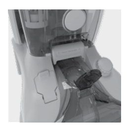
Open the hose connector cover.