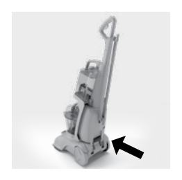
Press the recline pedal and pull the handle backwards.