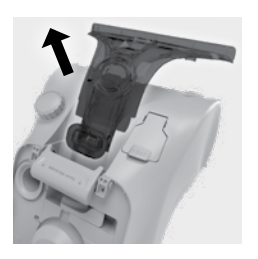
Hold the front of the nozzle and push down to release the nozzle away from the washer, once released lift to remove.