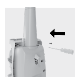
Insert the 2 screws and tighten using a cross head screwdriver.