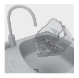
Empty the dirty water over the sink. Rinse the dirty water tank and lid under water (40°C max) to remove dirt/debris.