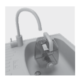
Fill the clean water tank with warm water (max 40°C).