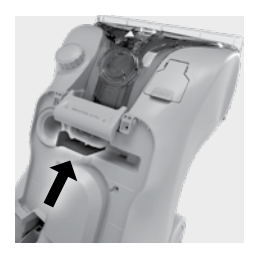
Lift the nozzle release clip to unlock the nozzle.