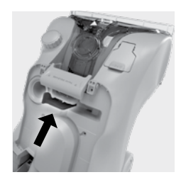
Lift the nozzle release clip to unlock the nozzle.