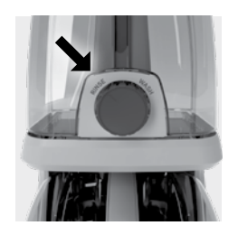
Turn the wash/rinse dial to rinse. Only water is released to remove solution residue.