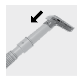
Slide the tool over the tab at the end of the hose until it clicks into place.