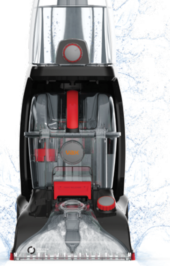
*Tested in quick clean mode. Results may vary.