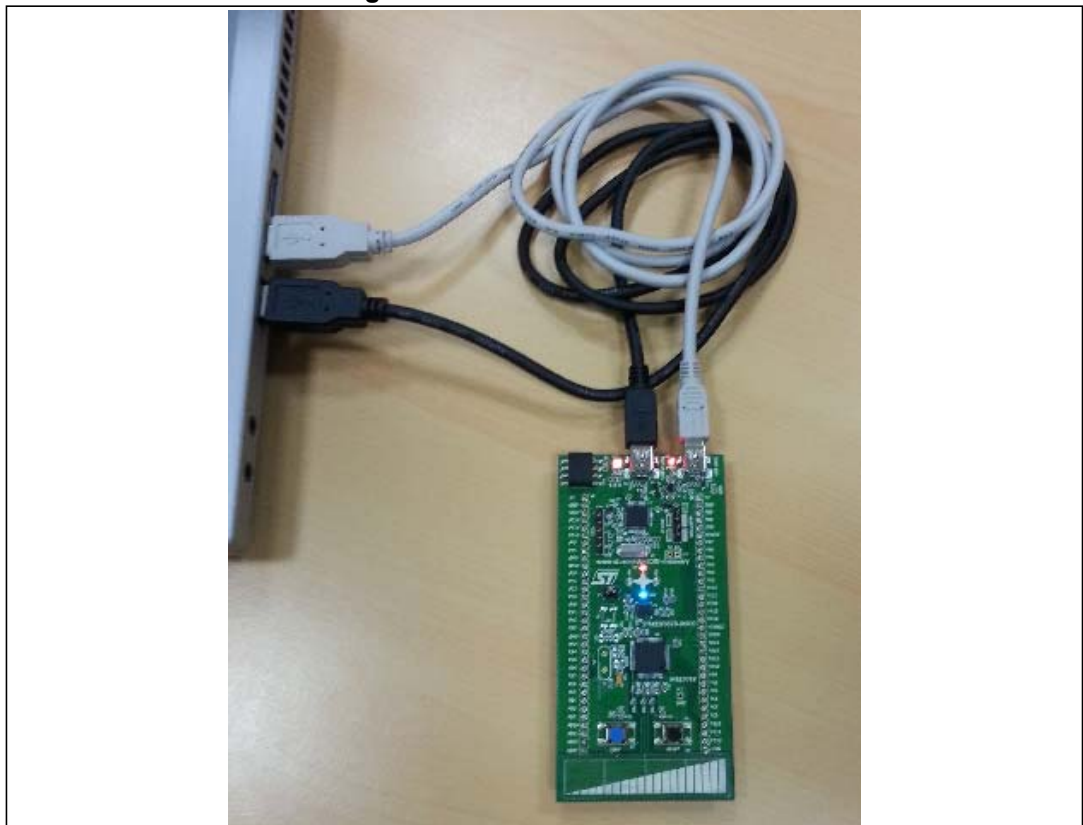
Figure 2. Hardware environment

Check jumper positions on the board, JP2 and CN5 are set to ON (Discovery mode).